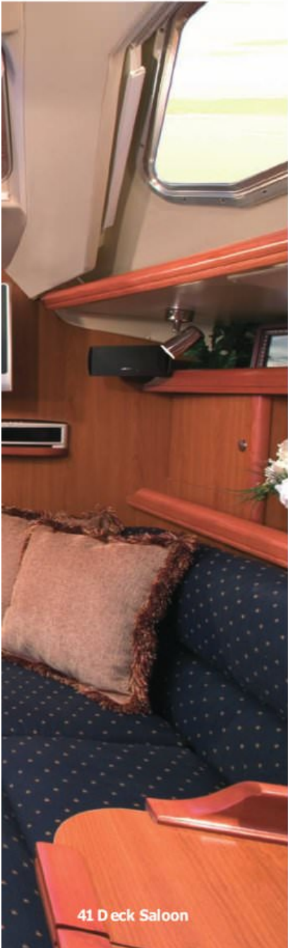
41 Deck Saloon