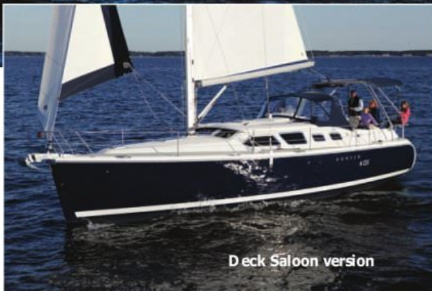
Deck Saloon version